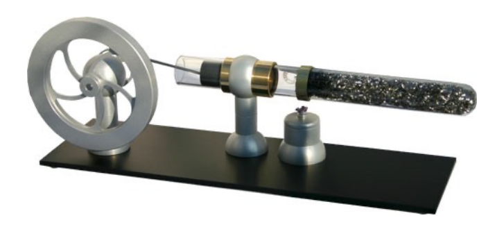
A purposely-made thermoacoustic piston engine (online picture)

One of the earliest concepts of the thermoacoustic engine and its effect was discovered by Lord Rayleigh in 1870s, and there wasn't much progress on the research until recently. The outreach event will be based on the original Rayleigh thermoacoustic piston engine. Unlike the internal combustion engines, the thermoacoustic engines are more unintuitive. Therefore, such simple experiments will be able to inspire the school kids and broaden their knowledge in engineering and physics.