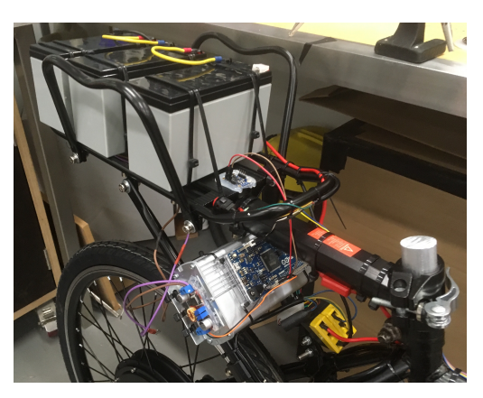
Figure 4: Power and Control Section

Secondly, after having successfully tested the Lego prototype, the full-scale bicycle was developed. This was an extraordinary amount of work and proved to be a real challenge. Areas of work included: component sourcing, mechanical design, electrical design, software development, as well as weeks and weeks of testing. Close-up pictures of the final bicycle can be seen below.