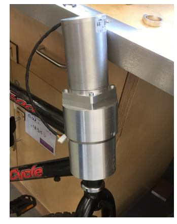
(b) Handlebar Actuator