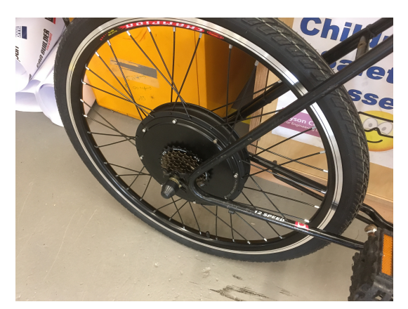
(a) Drive Actuator