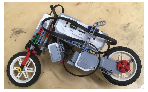
(a) Lego Prototype Bicycle