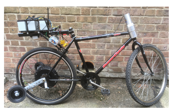
(b) Full-Scale Bicycle